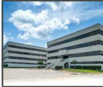
2400 & 2450 NASA 2400 & 2450 NASA PARKWAY HOUSTON, TEXAS 160,080 SF ACQUIRED 8/28/14