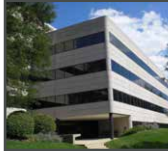
FOX VALLEY EXECUTIVE CENTER 75 EXECUTIVE DR. AURORA, ILLINOIS 107,087 SF ACQUIRED 11/05/10