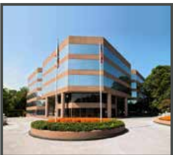
MERIDIAN 1995 NORTH PARK PLACE ATLANTA, GEORGIA 97,006 SF ACQUIRED 7/10/13