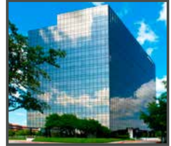
BANK OF AMERICA PLANO TOWER 101 E. PARK RD. PLANO, TEXAS 225,445 SF ACQUIRED 11/14/12