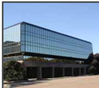
OFFICE ALPHA 13140 COIT RD. DALLAS, TEXAS 101,977 SF ACQUIRED 12/18/11