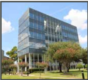
ONE NORTHWEST CENTRE 13831 NORTHWEST FWY. HOUSTON, TEXAS 151,835 SF ACQUIRED 10/7/10