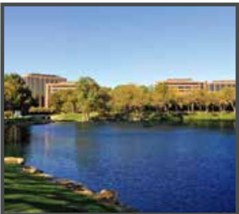
THE CENTRE AN 11-BUILDING OFFICE CAMPUS FARMERS BRANCH, TEXAS 817,000 SF ACQUIRED 12/23/13