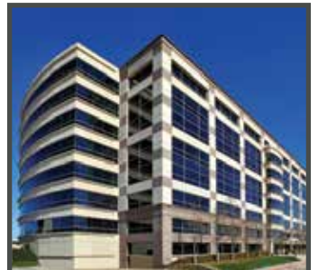
ONE PANORAMA CENTER 7701 LAS COLINAS RIDGE IRVING, TEXAS 208,450 SF ACQUIRED 7/6/12