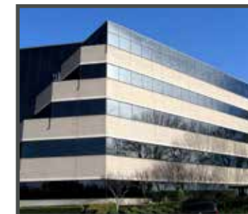
LA COSTA CENTRE 6300 LA CALMA DR. AUSTIN, TEXAS 81,675 SF ACQUIRED 4/2013