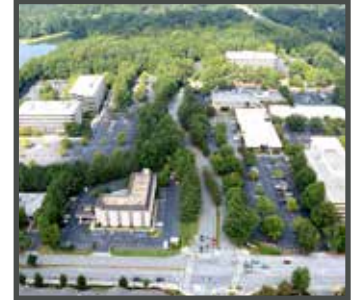
NORTHLAKE OFFICE PARK A 7-BUILDING OFFICE CAMPUS ATLANTA, GEORGIA 520,154 SF ACQUIRED 2/14/14