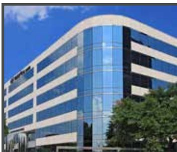
10100 N CENTRAL EXPRESSWAY 10100 N CENTRAL EXPY. DALLAS, TEXAS 94,294 SF ACQUIRED 6/17/13