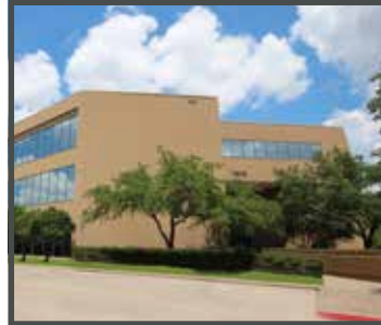
NORTHWEST CROSSING II 7676 HILLMONT STREET HOUSTON, TEXAS 135,571 SF ACQUIRED 6/24/14