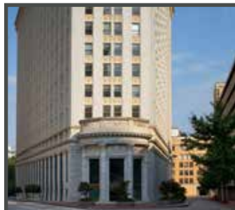
THE HURT BUILDING 50 HURT PLAZA ATLANTA, GEORGIA 436,340 SF ACQUIRED 2/17/12