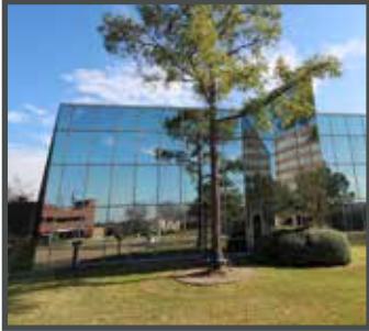
5005 MITCHELLDALE 5005 MITCHELLDALE ST. HOUSTON, TEXAS 75,900 SF ACQUIRED 12/17/12