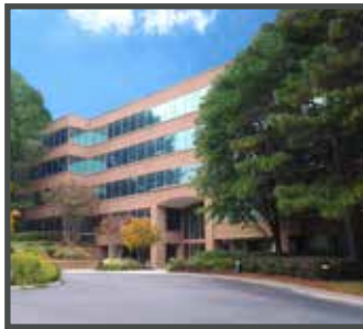
3675 CRESTWOOD PARKWAY 3675 CRESTWOOD PKWY. DULUTH, GEORGIA 93,867 SF ACQUIRED 11/3/12