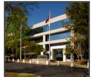
WATERSTONE 4751 BEST ROAD ATLANTA, GEORGIA 93,084 SF ACQUIRED 7/10/13