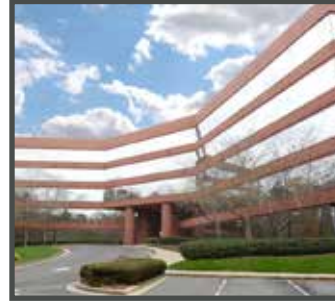
RIVER EXCHANGE 3295 RIVER EXCHANGE DR. NORCROSS, GEORGIA 115,000 SF ACQUIRED 12/3/12