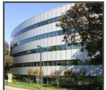
14800 QUORUM 14800 QUORUM DR. DALLAS, TEXAS 103,964 SF ACQUIRED 12/14/11