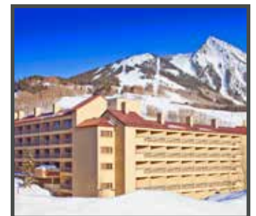
ELEVATION HOTEL & SPA 500 GOTHIC RD. CRESTED BUTTE, COLORADO 261 ROOMS ACQUIRED 2/7/13