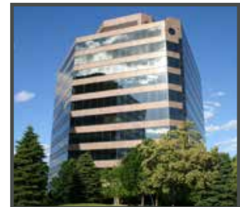
ONE CENTURY CENTER 1750 E. GOLF ROAD SCHAUMBURG, ILLINOIS 212,212 SF ACQUIRED 9/18/13