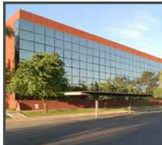
METROCENTER BUSINESS PARK 10000 N. 31ST AVE. PHOENIX, ARIZONA 128,180 SF ACQUIRED 8/30/12