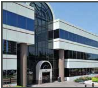
ROCHELLE PARK 600 E. JOHN CARPENTER FWY. IRVING, TEXAS 80,648 SF ACQUIRED 11/5/12