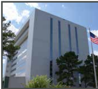
NORTHWEST COMMERCE BUILDING 14405 WALTERS RD. HOUSTON, TEXAS 170,685 SF ACQUIRED 6/18/10