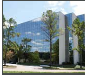
PARK ONE ON THE BAYOU 2500 EAST T.C. JESTER HOUSTON, TEXAS 159,563 SF ACQUIRED 11/18/10