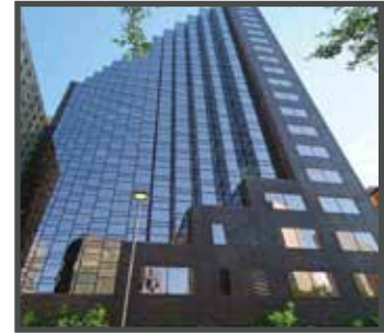
PACIFIC PLACE 1910 PACIFIC PLACE DALLAS, TEXAS 324,153 SF ACQUIRED 5/3/10