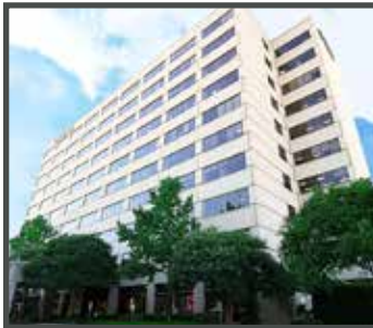
4100 SPRING VALLEY ROAD 4100 SPRING VALLEY RD. DALLAS, TEXAS 153,387 SF ACQUIRED 10/15/13