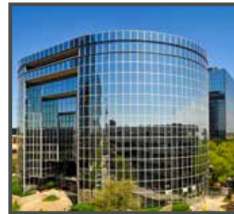
EXECUTIVE CENTER II & III 8330-8360 LBJ FWY. DALLAS, TEXAS 385,993 SF ACQUIRED 5/25/10