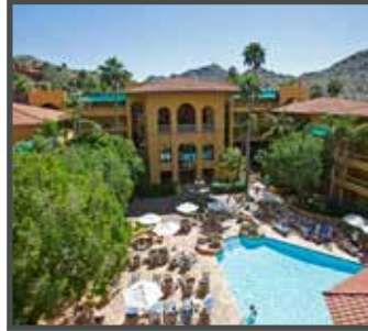
POINTE HILTON TAPATIO CLIFFS RESORT 1111 NORTH 7TH ST. PHOENIX, ARIZONA 584 ROOMS ACQUIRED 12/13/12