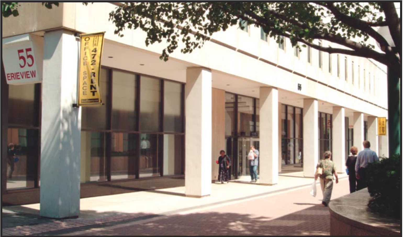
55 Erievue Plaza • Cleveland, OH